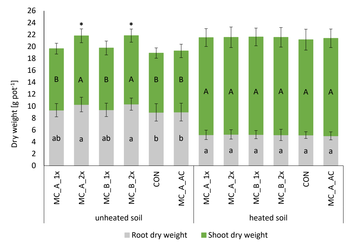
Figure 1. Contribution of shoots (green columns) and roots (gray columns) to total plant dry weight production per pot of wheat grown for 63 days in unheated or heated soil. Plants were either inoculated once (1×) or twice (2×) with one of the two microbial consortia (MC_A or MC_B), not inoculated (CON), or inoculated with autoclaved MC (MC_A_AC). Data represent the mean and standard deviation of duplicate trials with six replicates per trial. Different letters in the columns (small letters: root dry weight; capital letters: shoot dry weight) indicate significant differences between treatments within one soil substrate. Asterisks indicate significant differences in total plant dry weight within one soil treatment; Tukey test (p < 0.05).

with the plants cultivated in the heated soil. Hence, the MC were able to compensate for the growth advantage arising from soil heating by favoring root and shoot growth by the same order of magnitude (Figure 2). On average, plants grown in heated soil had an almost three times higher shoot—root ratio (3.2) compared to plants grown in unheated soil (1.1). This equal improvement in shoot and root growth was different from the single and simple nutritional effect of soil heating and, thus, might be an indicator of a long-lasting, resilient, and balanced growth increase. Furthermore, in unheated soil, a strong positive correlation was noted between wheat shoot and root biomass production with respect to the MC application frequency (Figure 2).