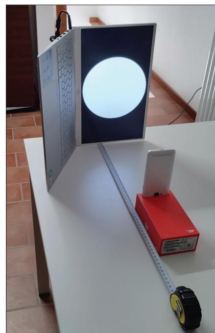
Fig. 2. Picture of the experimental setup.

Equation (2) correctly converges to Eq. (1) for d \gg R , and to a constant value in the limit d \ll R . In particular, E^D = \pi L for d = 0 . The product \pi L is defined as the luminous exitance